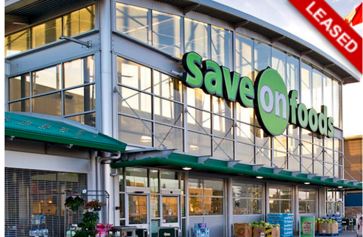
Save-On Foods New Location coming soon to Pembina Crossing