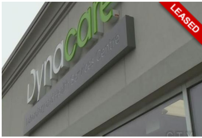
Dynacare Opening super sites across City of Winnipeg