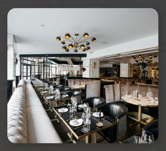
CLICK HERE FOR DINNER MENU

$$$$ - https://primeandproperdetroit.com/