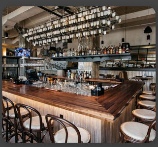
CLICK HERE FOR DINNER MENU