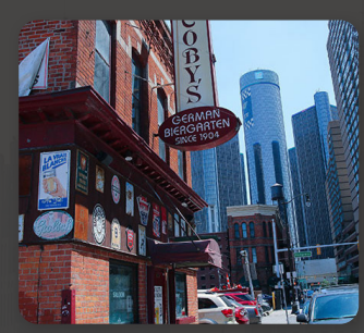
CLICK HERE FOR DINNER MENU