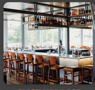
<u>CLICK HERE FOR</u> <u>DINNER MENU</u>