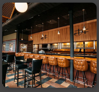
CLICK HERE FOR DINNER MENU

$$ - https://www.hopcat.com/detroit/home