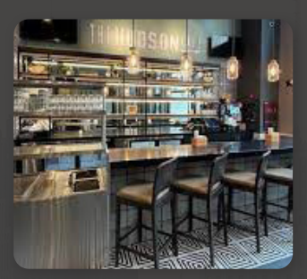
CLICK HERE FOR DINNER MENU