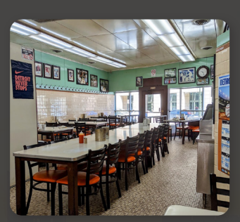
CLICK HERE FOR DINNER MENU