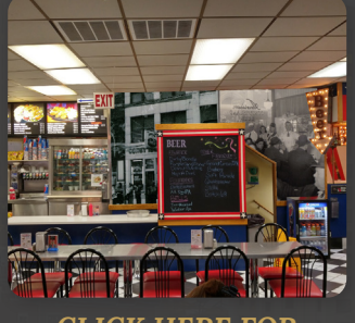
<u>CLICK HERE FOR</u> <u>DINNER MENU</u>

$ - http://www.americanconeyisland.com/home.htm