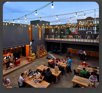
<u>CLICK HERE FOR</u> DINNER MENU

$$ - https://www.detroitshippingcompany.com/