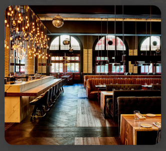
CLICK HERE FOR DINNER MENU

$$$ - https://detroitfoundationhotel.com/apparatus-room/