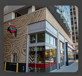
CLICK HERE FOR DINNER MENU