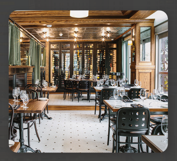
<u>CLICK HERE FOR</u> <u>DINNER MENU</u>