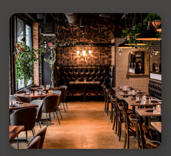
CLICK HERE FOR DINNER MENU