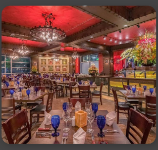
CLICK HERE FOR DINNER MENU