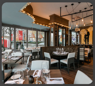
CLICK HERE FOR DINNER MENU